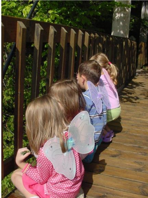
Community Programs at the Boardman River Nature Center