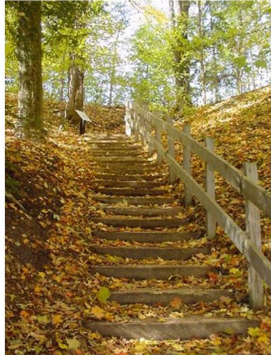
Public Land Management