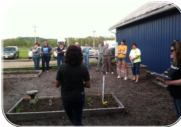
Class at community garden (summer)