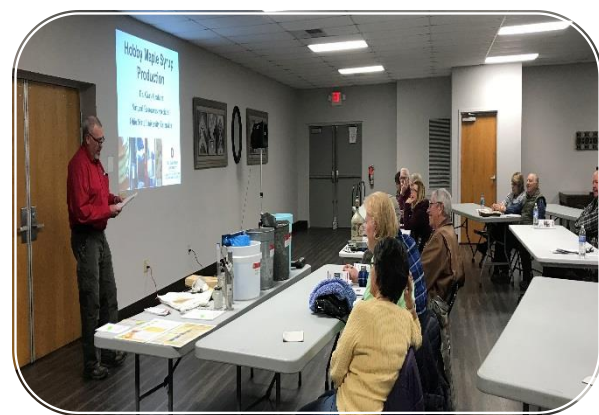
Indoor class (winter)