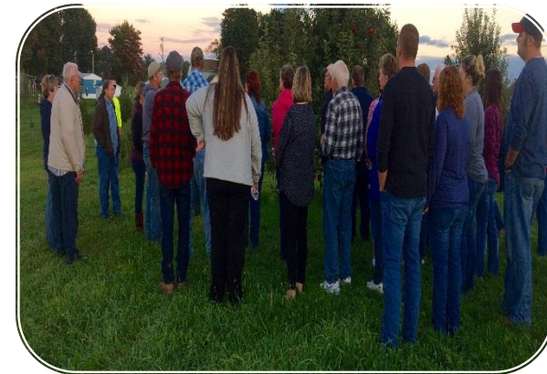
Field trips (spring/fall)