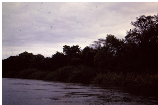
Figure 2. In the 1950s the banks of the Zambezi River were stable and well vegetated, despite the high numbers of game and the presence of hunting, gardening humans (p. 21). 22

When I looked at Photo 3-2 (Fig. 2) of a well-vegetated Zambezi River in the 1950s and Photo 3-3 (Fig. 3) of a deteriorated Zambezi River in the 1980s, two other papers crashed together in my mind. Luckily, I had read both only a few days before. Because of contemporary culture's innate bias against the value of active human management, I'd read those pages of Savory many times before and never realized that they applied to anything beyond elephants.