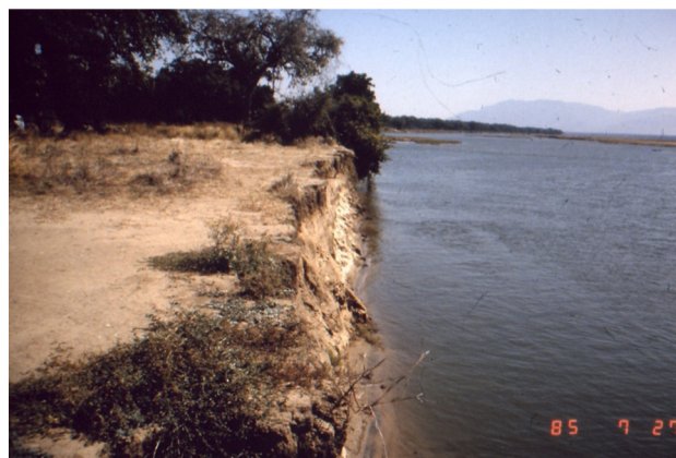
Figure 3. By the 1980s the banks of the Zambezi River within the national park were nearly devoid of vegetation, even though game populations had been culled heavily and the hunting, gardening humans removed (p. 22). 22

But what took my breath away was noticing Savory's pictures were about 30 years apart, and just 25 years before Captain Lewis wrote that entry, a smallpox epidemic had devastated the Pikuni. 21