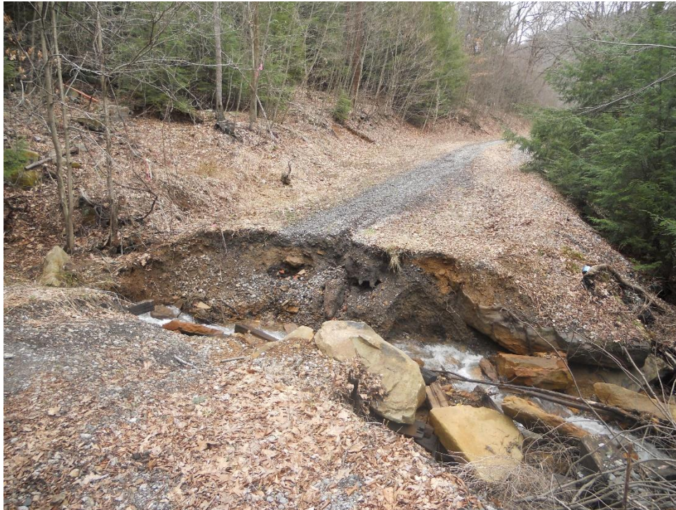
Erosion Problem- Armstrong trail